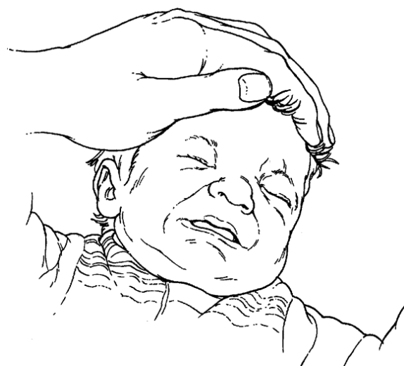
Picture 1 Gently rub the baby's head to help him fall asleep